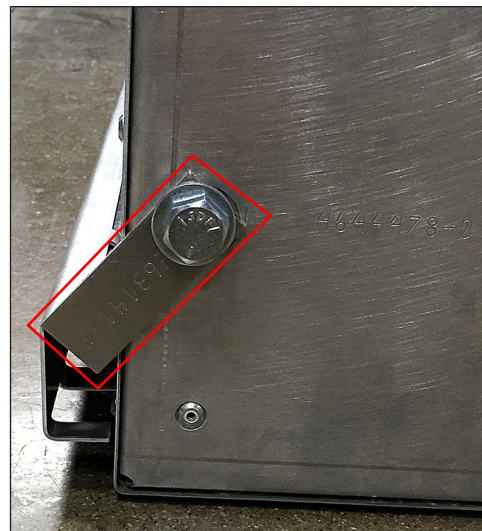
Figure 3: Location of Assembly