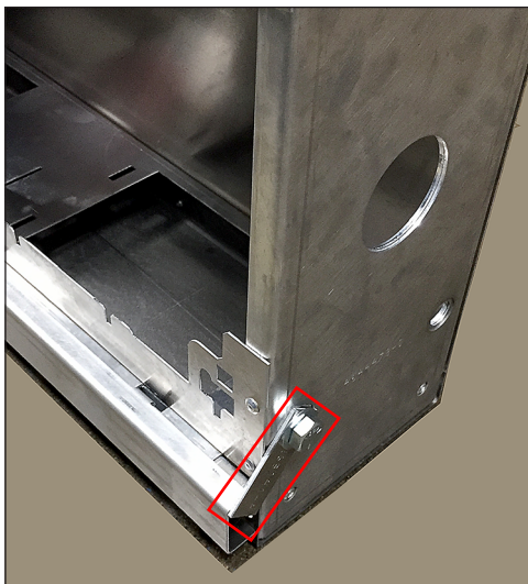
Figure 2: Location of Assembly

Caution: Leave the assembly in place as long as possible. It temporarily holds the sections together until the two sections are permanently joined to one another.