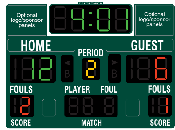
BB-3103 Volleyball mode

For additional information on Daktronics scoring/timing products, call 605-697-4300 or 800-325-8766.