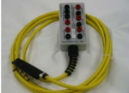
Lane Module IV